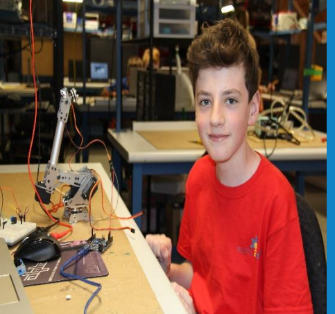
Shopping at CrossIron Mill Outlet PLUS attend SPECIAL STEM class and complete a project with Canadian students