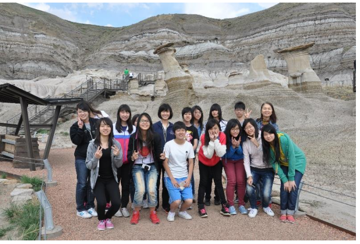
Dinosaur Town: Drumheller & Royal Tyrrell Museum of Palaeontology