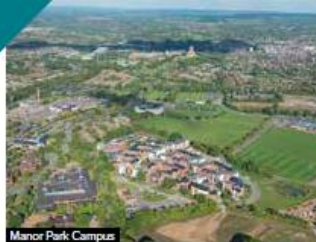
Manor Park Campus