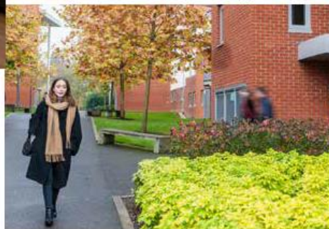
Manor Park Band E

These rooms have a double bed, and an en-suite shower room with toilet and washbasin. Most are located in flats of six lower band rooms sharing a kitchen.