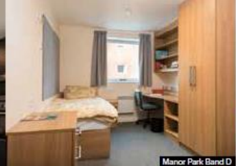
Manor Park Band D