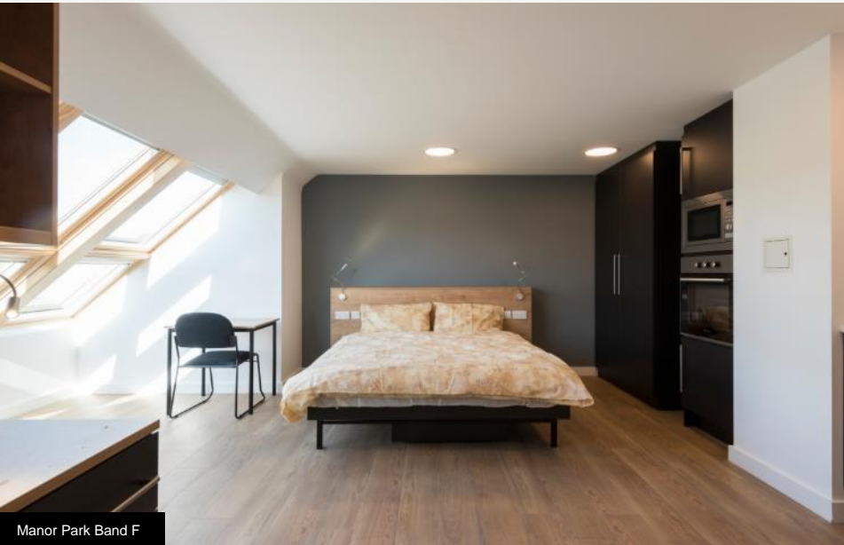
Manor Park Band F