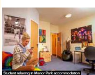
Student relaxing in Manor Park accommodation

90% OF STUDENTS JOINING IN SEPTEMBER 2019 RECEIVED THEIR FIRST CHOICE OF ACCOMMODATION