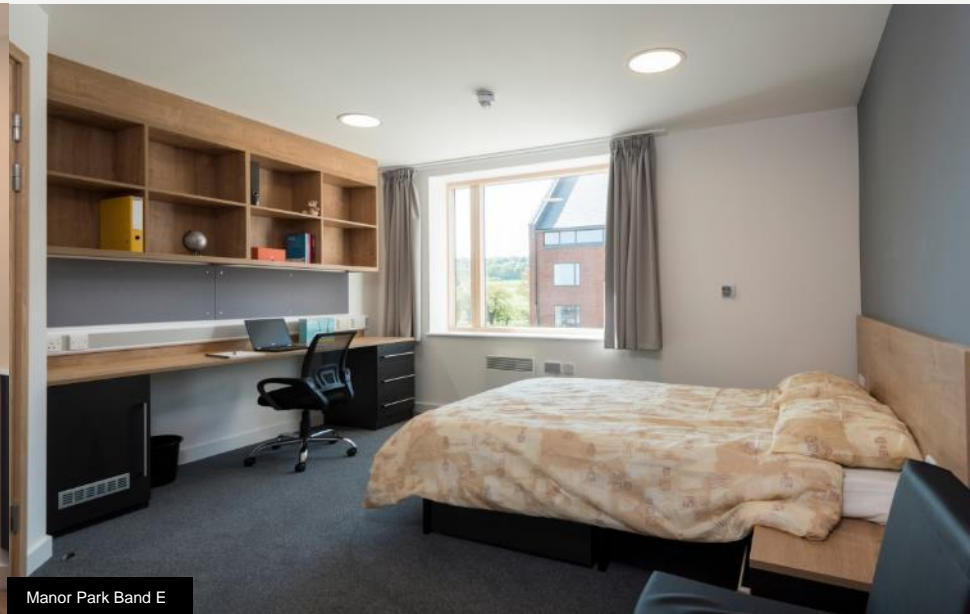
Manor Park Band E