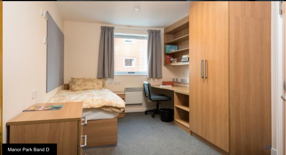
Manor Park Band D