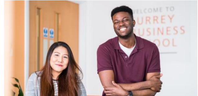
Business, Economics Law and Social Sciences

The International Foundation Year is a programme of academic subjects, study skills and English language training designed specifically to provide international students with a pathway to undergraduate degree study at the University of Surrey, one of the UK's most prestigious universities.