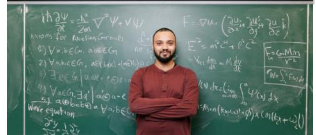
Engineering and Physical Sciences