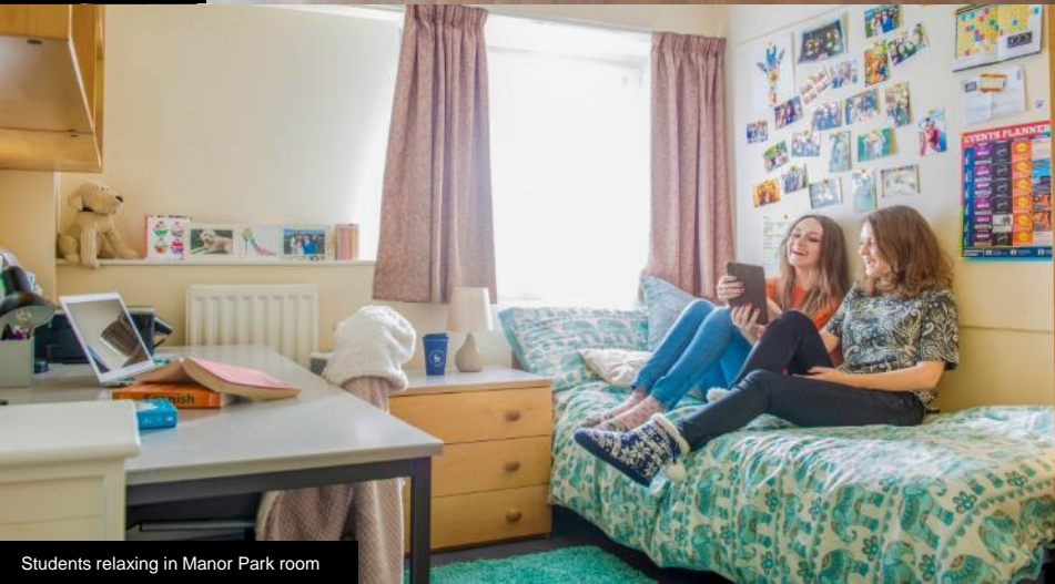
Students relaxing in Manor Park room