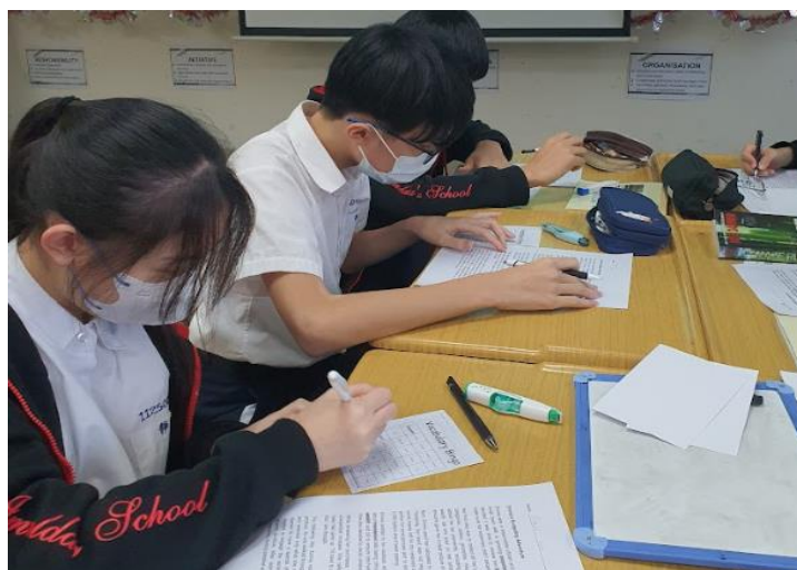
Left image: Students reading the text and playing Vocabulary Bingo simultaneously.